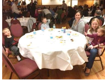
Kids attended a pre-Lenten retreat