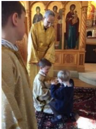
Our newest altar server