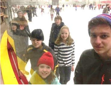
Saint Michaels' youth group SOYO spent an afternoon at the Hyannis ice rink.